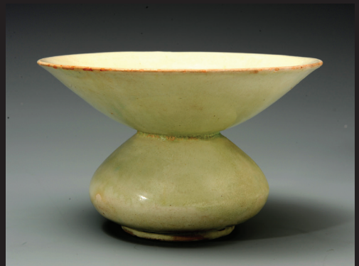
唐 邢窯 淡綠釉渣斗

“盈”字款代表“大盈庫”，帶“盈”字款的瓷器表示這類瓷器是專為皇宮內大盈庫燒製的貢器。“翰林”是指“翰林院”，位於大明宮內的西城。帶“翰林”款的白瓷是專供“翰林院”使用的貢器。唐代邢窯帶“官”字的器物甚少。從前，學者會把這類器物定為定窯的產品。但自從在2003年在邢窯窯址發現了一批帶“官”字的碗和盤的殘件後，人們才知道邢