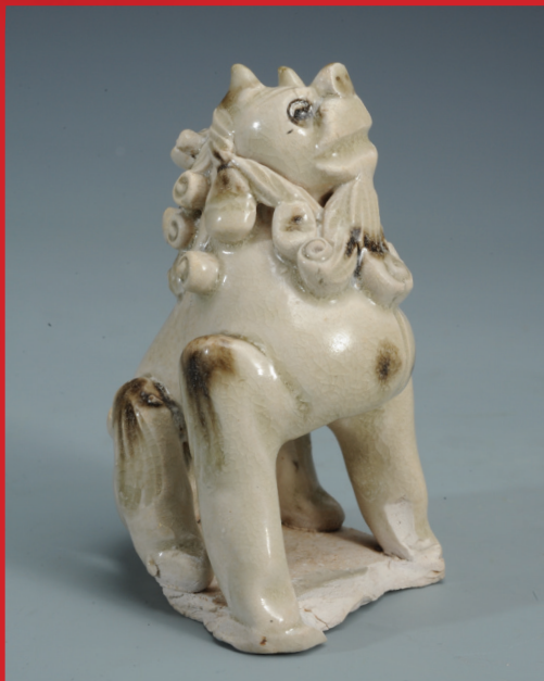
唐 邢窯 白瓷獅子

A White Porcelain Lion, Xing Ware, Tang Dynasty