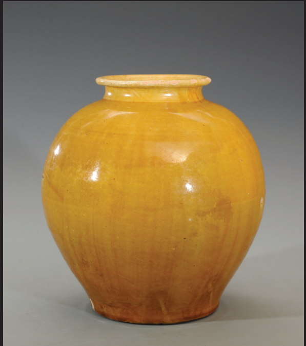
唐 邢窯黃釉罐 A Yellow Glazed Jar, Xing Ware, Tang Dynasty h 19.6 x 19 cm